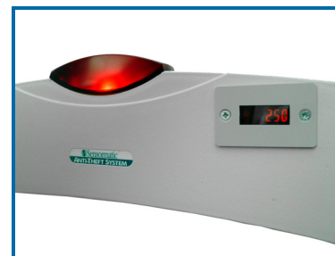
Eye-level built-in digital alarm counter